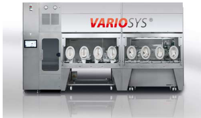
VarioSys: A highly flexible and at the same time compact and time-saving system suitable for small-batch production. Several components can be linked in series to form a production line, as required.

At interpack, a full-scale model showed how exactly the system works: a B+S module for processing syringes in nests, SFM 5105, is in-