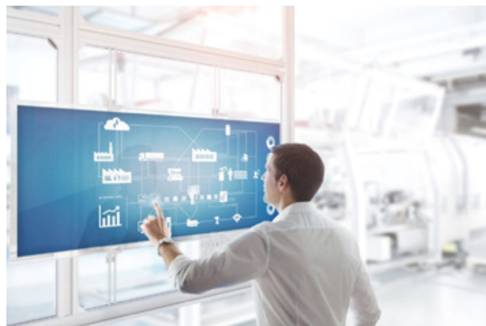
Efficient maintenance aid: The Maintenance Support System (MSS) analyzes machine data in real-time and helps operators and maintenance engineers efficiently execute all kinds of maintenance activities.

Thanks to Virtual Reality (VR), operators can view the virtual image of their real machine, for instance via a smartphone which is integrated into a pair of glasses. VR applications especially facilitate error location and troubleshooting. They can, however, also be used