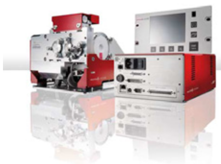
Pfeiffer Vacuum ASI 35 modular leak detector

Leak testing plays a vital part in quality control in a wide range of applications. Reliable integrity of primary packaging is of crucial importance in the pharmaceutical industry to guarantee sterility and protect drugs from any microbiological substances, oxygen or moisture that may ingress. In the automotive industry, leak testing ensures that various components are operating perfectly, including parts guaranteeing the supply of gasoline. Pfeiffer Vacuum is one of the leading providers of vacuum technology and leak testing solutions. The corporation benefits from more than 50 years of experience in the field of leak detection. At the Interpack and Control fairs, Pfeiffer Vacuum presented test technologies that satisfy numerous leak detection and measuring method requirements: leak detection using air, leak detection with a tracer gas and optical emission spectroscopy.