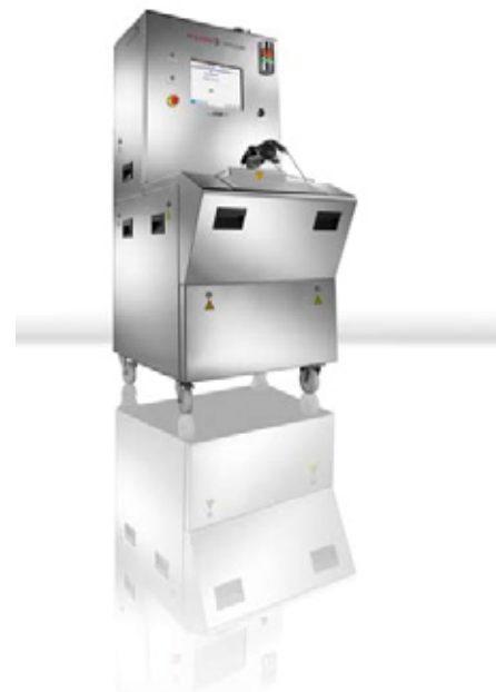
Integrity testing of high-sensitivity medication packaging and sealed highly sophisticated parts using Pfeiffer Vacuum AMI