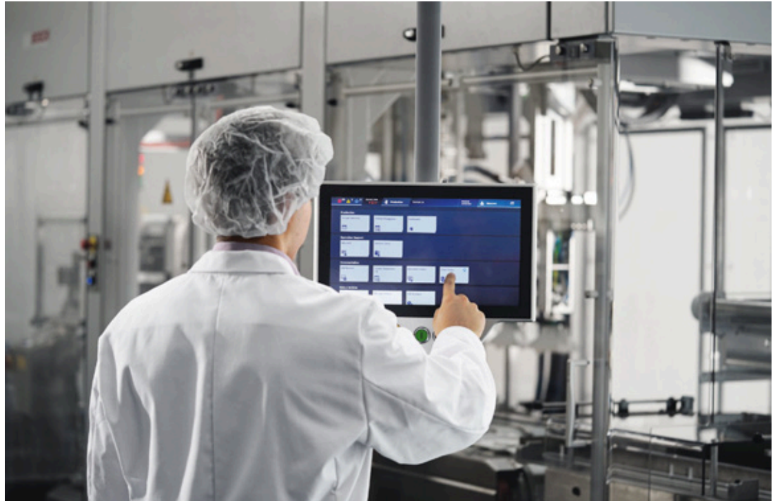
A new level of efficiency: Bosch's i4.0 applications optimally support operators as well as service and maintenance personnel in their daily work - and help them to carry it out faster and more efficiently.