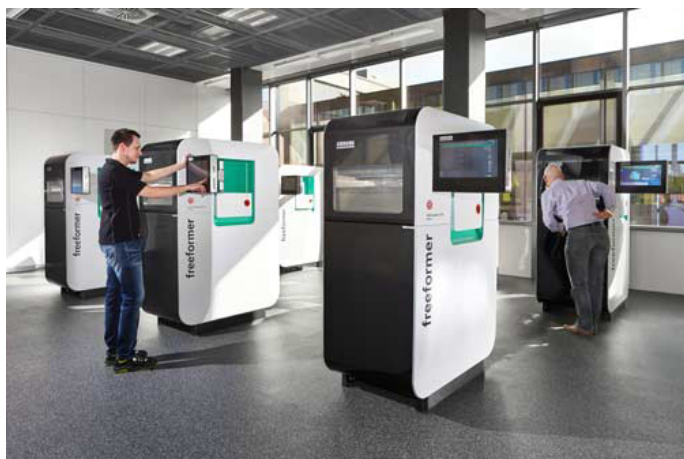
Sample parts are produced on six Freeformers in the new Arburg Prototyping Center in response to customer inquiries.