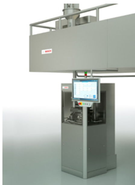
Efficient tableting on the Xelum platform: The integrated Xelum tablet press connected to the human machine interface (HMI) of the Xelum platform ensures efficient tableting.

Robert Bosch Packaging Technology GmbH Stuttgarter Straße 130 D 71332 Waiblingen Telefon: +49 711 811 0 Telefax: +49 711 81158509 E-Mail: packaging@bosch.com Internet: http://www.boschpackaging.com