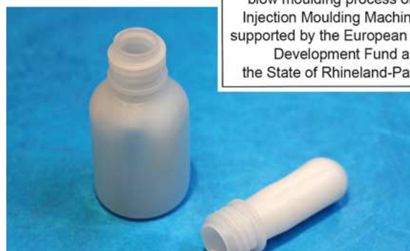
Illustration of the preform and fully blown eye drop bottle

In the first step, four preforms are injection moulded, rotated 180 degrees around an index plate and then inflated with compressed air to produce the finished bottle contour in the same mould. The finished eye drop bottles are packaged directly after demoulding in the clean mould area of the clamping unit and carried off by a conveyor belt.