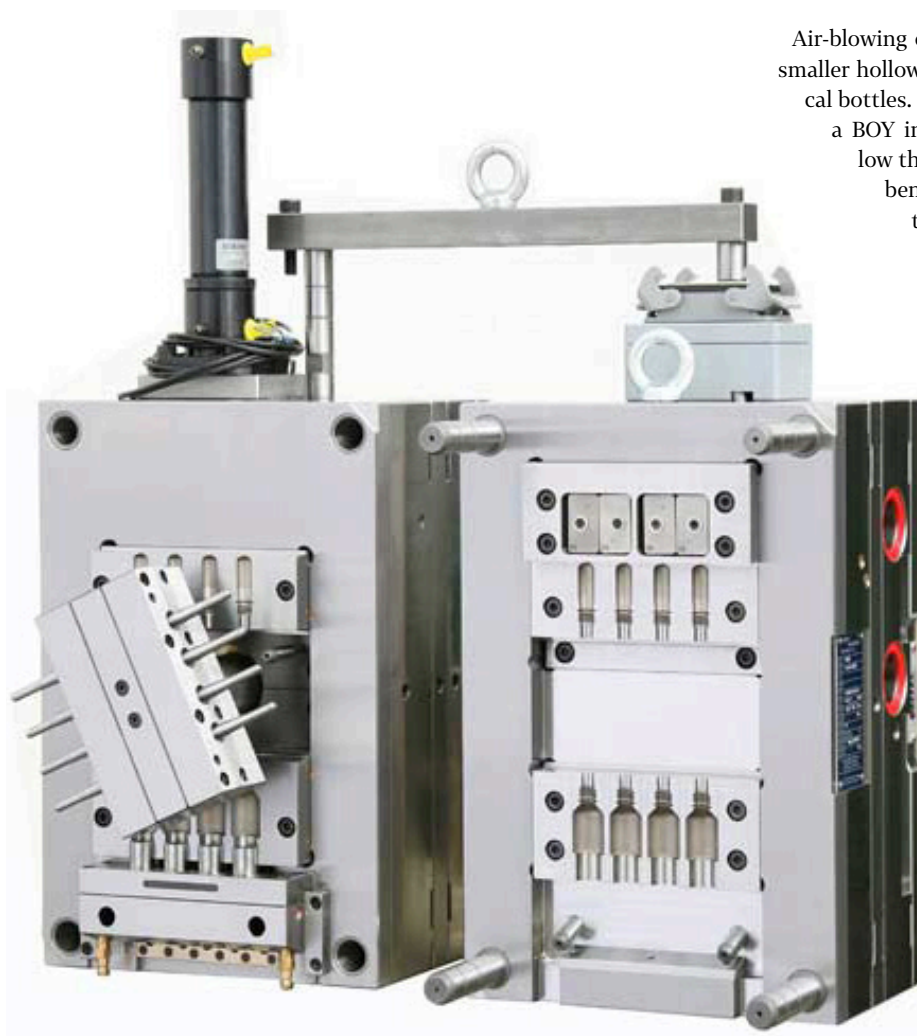
Illustration of the injection moulding tool

Air-blowing on an injection moulding machine is suitable for smaller hollow bodies, such as cosmetics, food or pharmaceutical bottles. The cost of the production machine – in this case a BOY injection moulding machine – is significantly below the cost of a pure injection moulding machine. One benefit of air-blowing is the possibility of manufacturing even more complex contours at the bottle neck extremely precisely, which is only possible to a limited extent in traditional blow mould processes.