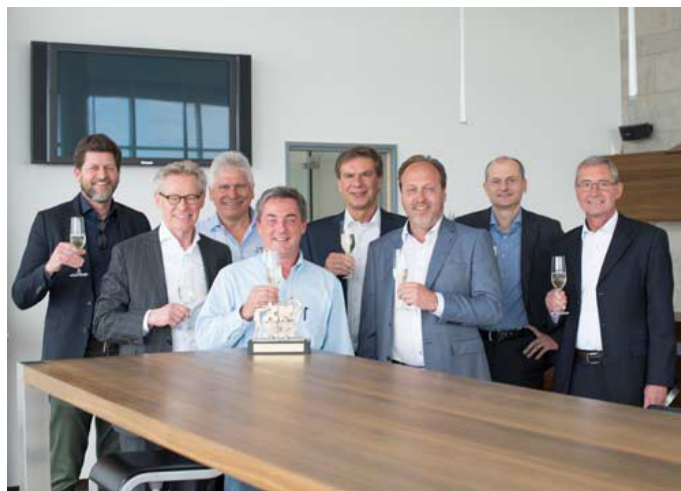
Solemnly incorporation of Super Dry Totech into the ASYS Group