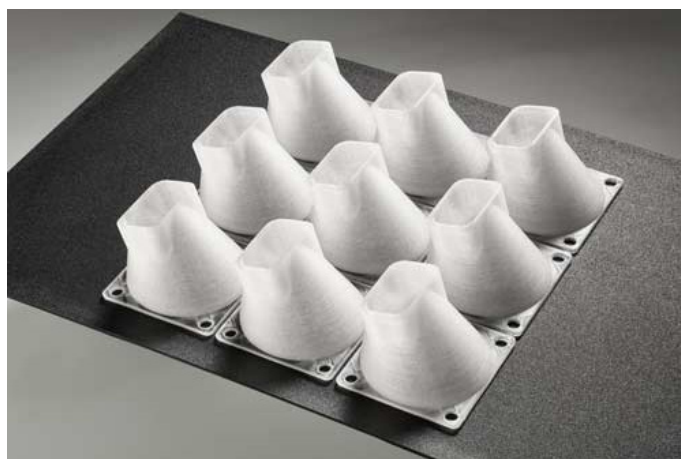
As an example of an aerospace application, a Freeformer produces air ducts made of PC specially approved for the aviation industry at the Rapid.Tech 2017.