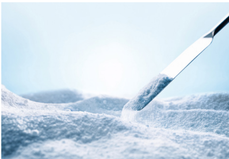
Granulation technology on the Xelum platform: The Xelum platform offers pharmaceutical manufacturers a unimodal particle size distribution, as well as especially good flow and tableting properties of the granules, and high product yields.