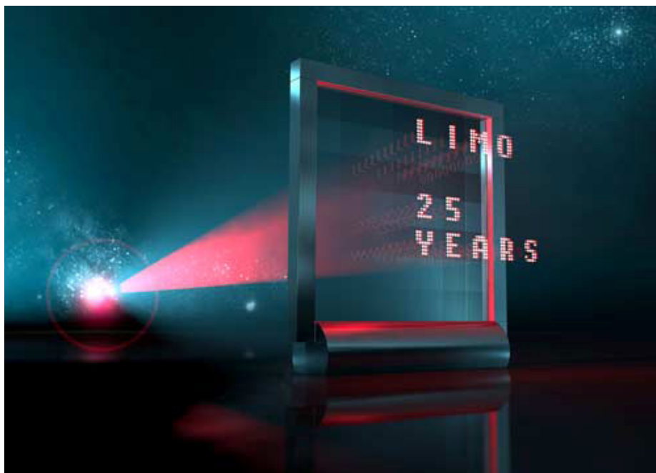
25 years of LIMO: The optics and beam shaping solutions specialists have been developing innovative technologies for research and industry since 1992, and have constantly unlocked new possibilities along the way.