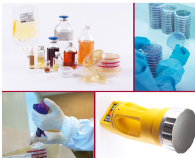
Cherwell Laboratories product range for environmental monitoring and process validation.